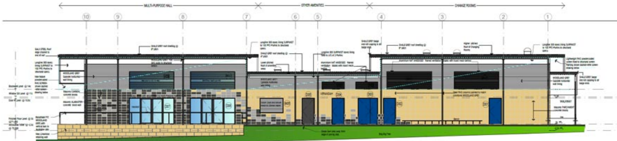
1 NORTH ELEVATION - showing finishes 1:100