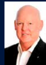
Cr Brett Treby Elected in 1999