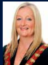
Mayor Tracey Roberts JP Elected in 2011