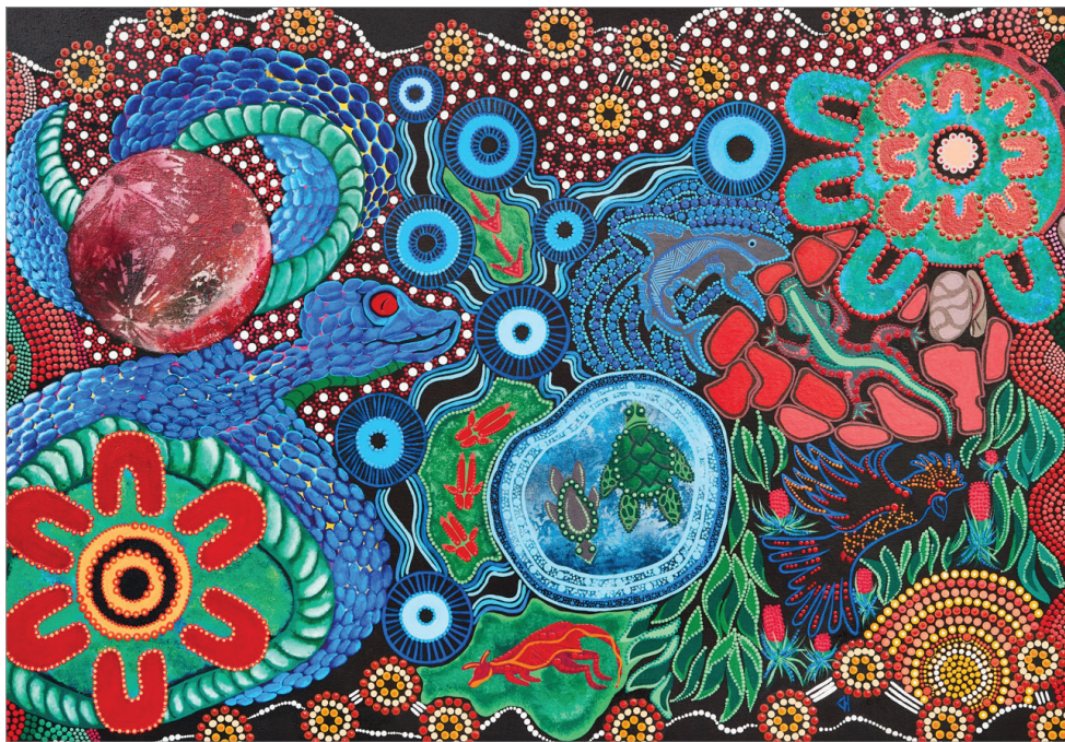
Courtney Hill, Nyitting Wanneroo (Detail).