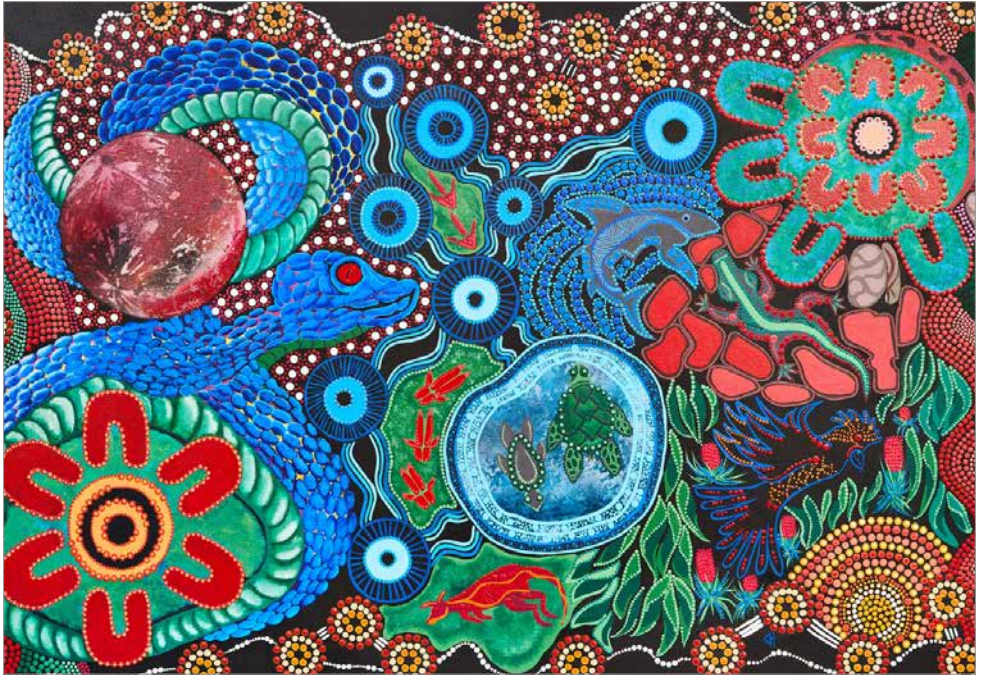
Courtney Hill, Nyitting Wanneroo (Detail).