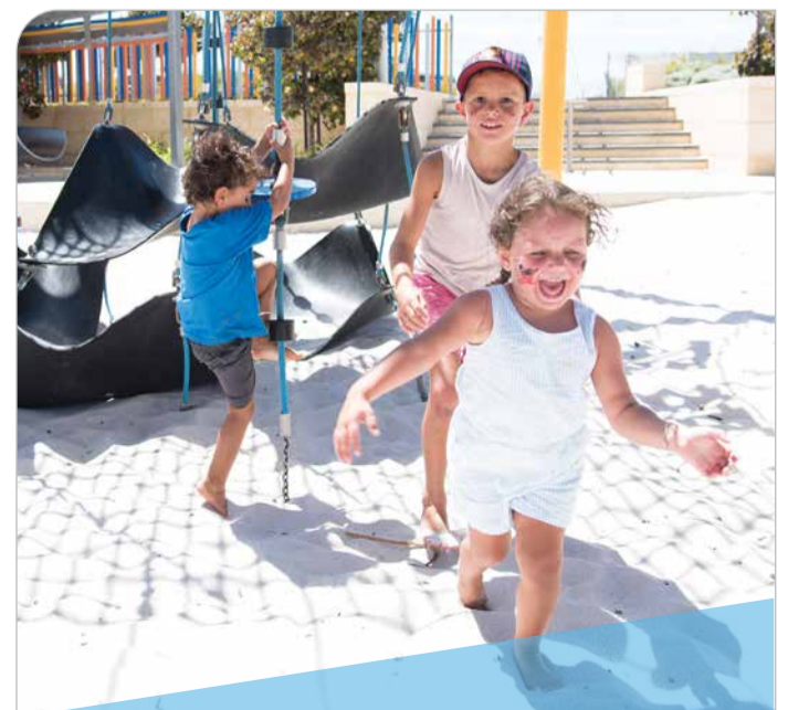
Figures shown represent both Operational and Capital Works funding from the City of Wanneroo's 2020/21 Budget.