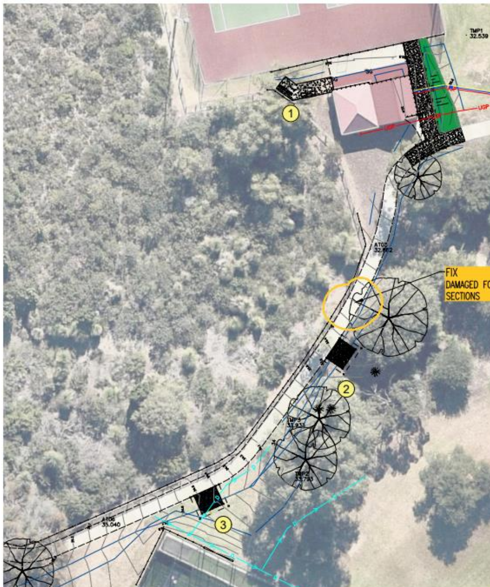
CONSTRUCTION PLAN REF: 3901-4-0