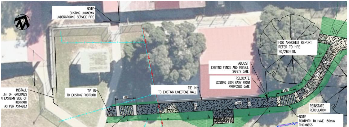
CONSTRUCTION PLAN REF: 3901-5-0