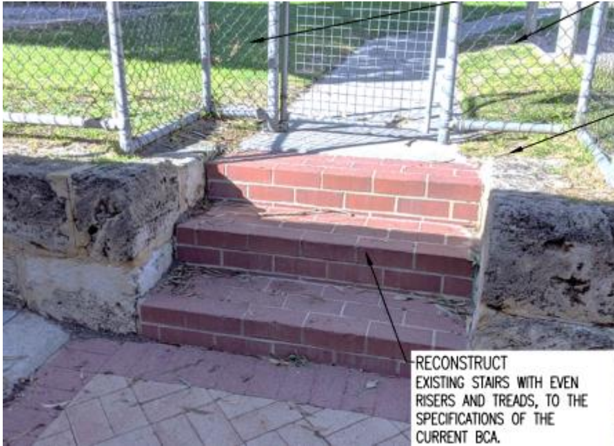
CONSTRUCTION PLAN REF: 3901-5-0