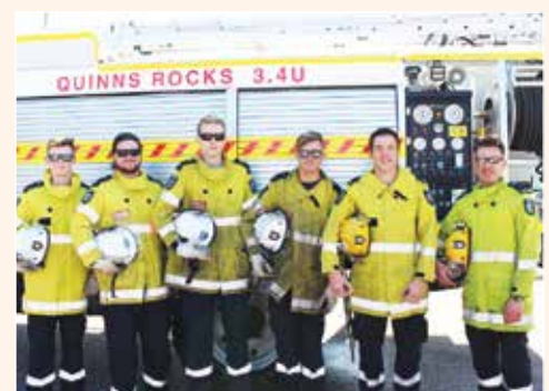
Volunteers from Quinns Rocks Bushfire Brigade.

Visit dfes.wa.gov.au for more information about bushfire planning.