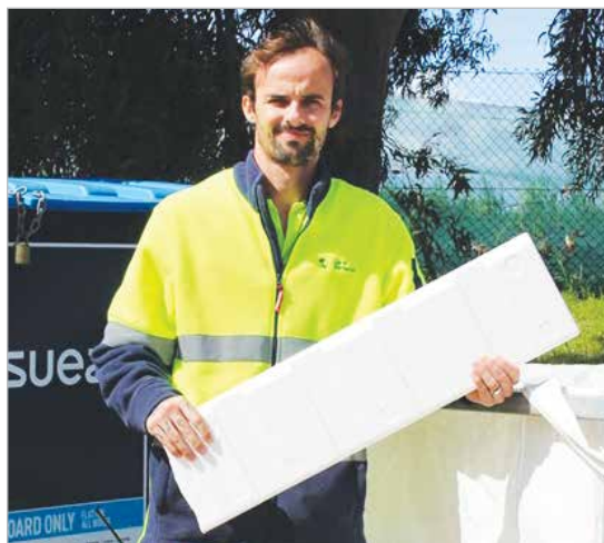
Polystyrene packaging can now be dropped off at Wangara Greens Recycling Facility.

Used wrapping paper can be smoothed flat and dropped straight into your yellow top recycling bin.