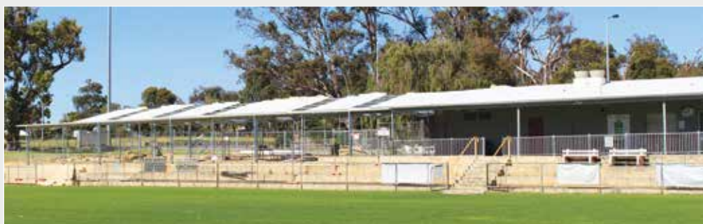
Works are underway on a new sports amenities building in Madeley.

"My club has been playing in the local area for 26 years and it will be great to have this upgraded facility as our home base."