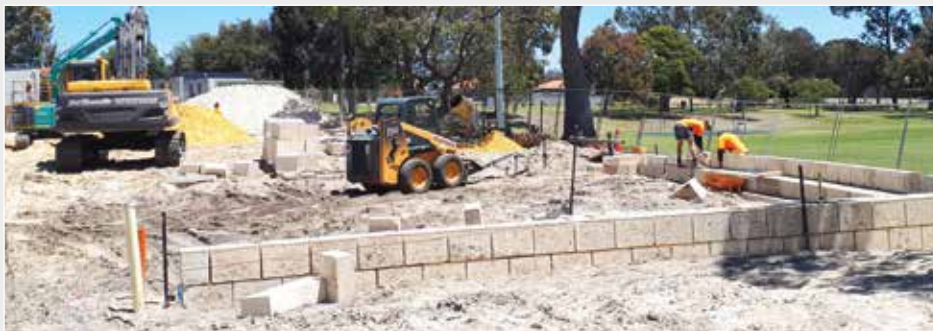
Work is now underway on the new sports amenities building at Shelvock Park.