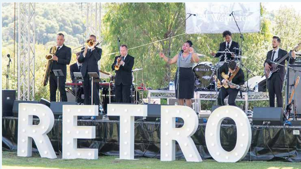
Returning favourites: The Milford Street Shakers will rock Yanchep National Park during Retro Rewind in February.