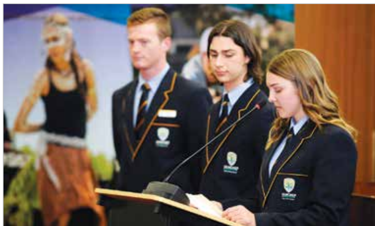
Participants sharing the outcomes of their project at the Youth Leadership Showcase.