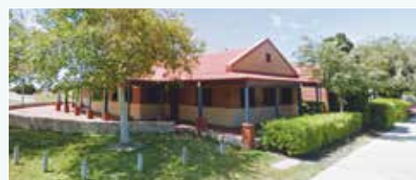
Clarkson Youth Centre.

Following community consultation conducted in October, concept designs for an upgraded Clarkson Youth Centre will be taking shape in the coming months. Construction is anticipated to occur from August 2021 for completion by May 2022.