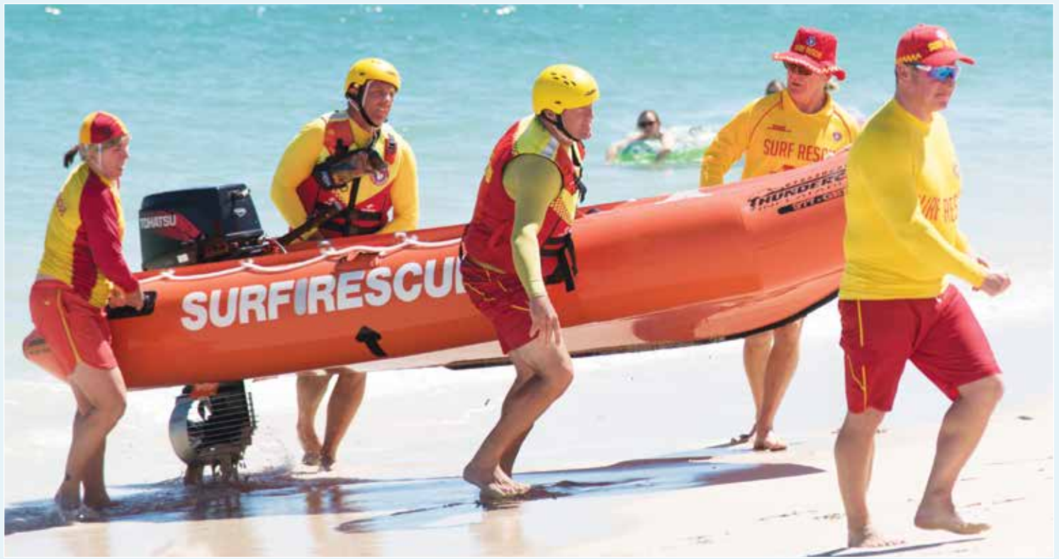
Yanchep Surf Life Saving Club.