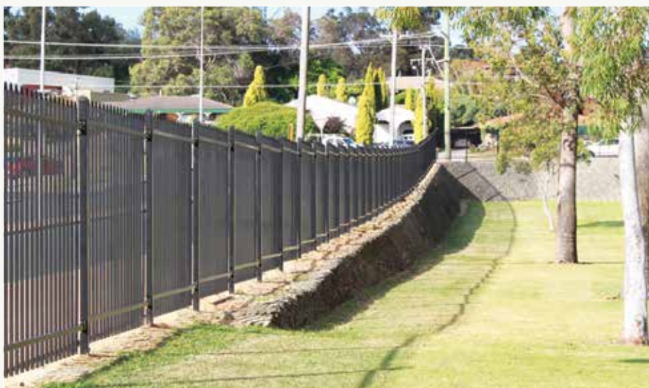
New garrison fencing will improve security at the Wanneroo Showgrounds.

Construction is expected to commence in winter 2021.