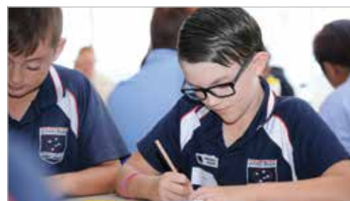
Students from Quinns Beach Primary School hard at work on their community project.

For more information, follow the 'City of Wanneroo Youth' page on Facebook.