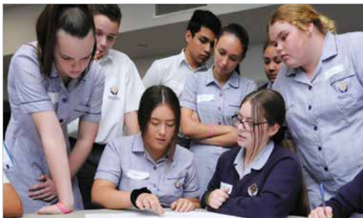
Students from Irene McCormack Catholic College brainstorm ideas.