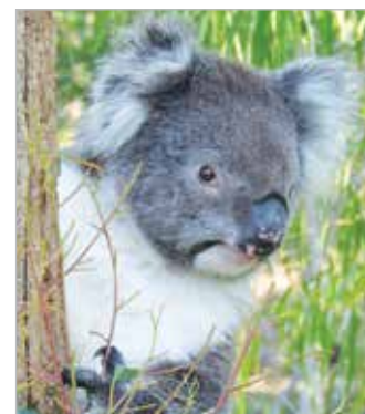
Courtney Joy Pascoe: Koala, Yanchep National Park.

To see the shortlisted top 25 photos, please visit wanneroo.wa.gov.au/photocomp