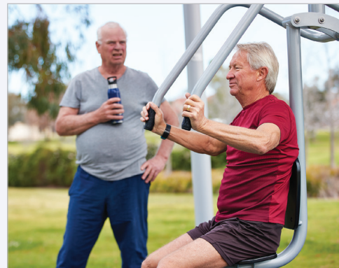
Monaghan Park, Darch