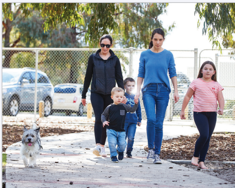
Edgar Griffiths Dog Park, Wanneroo