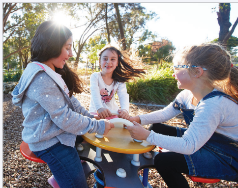
Dinosaur Park, Madeley.