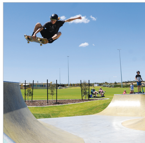
Splendid Park skate park, Yanchep.

Construction on this popular skate park in Yanchep was completed in mid-2020 and was co-funded by the State Government, Lotterywest and the City of Wanneroo.