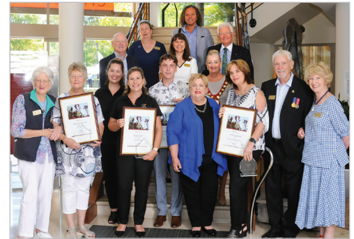
2021 City of Wanneroo Australia Day Award recipients.

Four awards will be presented at our 2022 Australia Day citizenship ceremony: