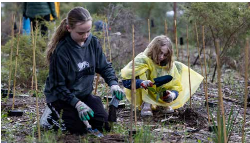
Local families getting stuck into a community planting event at Voyager Park in July.

With the support of the Friends group, the City installed conservation fencing to protect the flora and laid a track to prevent people walking over the vegetation.