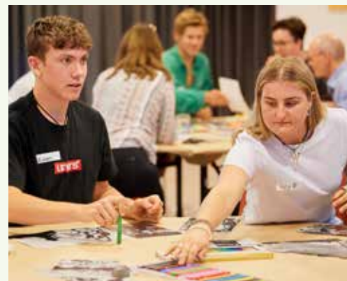
Attendees of last year’s Youth Forum on Climate Change.

*Note: Diesel fleet target based on emissions per bin per year. Total fuel use and associated emissions expected to rise in the short-term due to new households in growing suburbs being serviced by waste fleet.