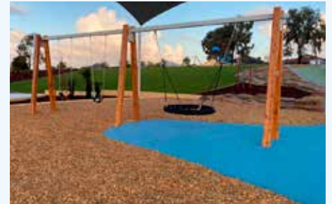
Accessibility was front of mind when designing the new Hinckley Park amenities.