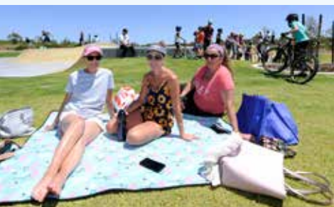
The new cycling facility at Splendid Park will wind its way around the existing facilities, such as the skate park.

A state-of-the-art cycling facility at Splendid Park is one step closer, after Council endorsed a detailed design in July.