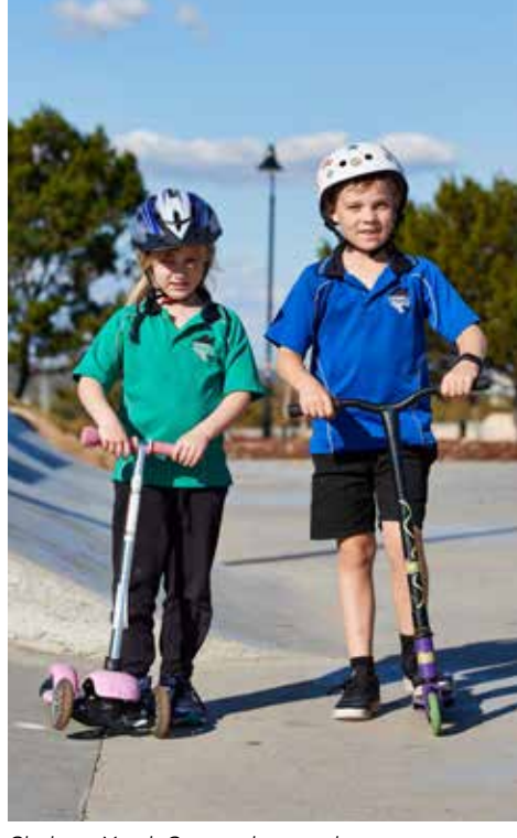
Clarkson Youth Centre skate park.

"In the short-term, we could look at adding solar lighting to the trees in the median strip, and long-term, we might build a lending library, install a community garden or fix some planter beds in a parklet to bring people together in our corner of Clarkson.