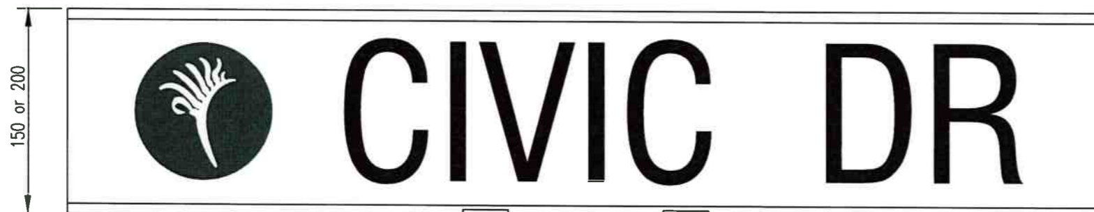
16-30 TYPICAL FOR USE WITH EXISTING SIGN NUMBERING OPTION 3 SCALE: 1:5