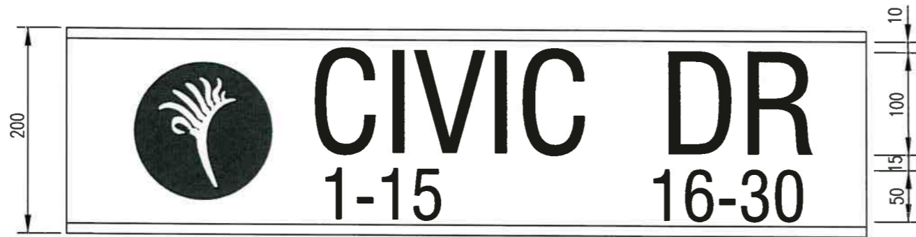
TYPICAL FOR PRIMARY & DISTRICT DISTRIBUTOR NUMBERING OPTION 1 SCALE: 1:5