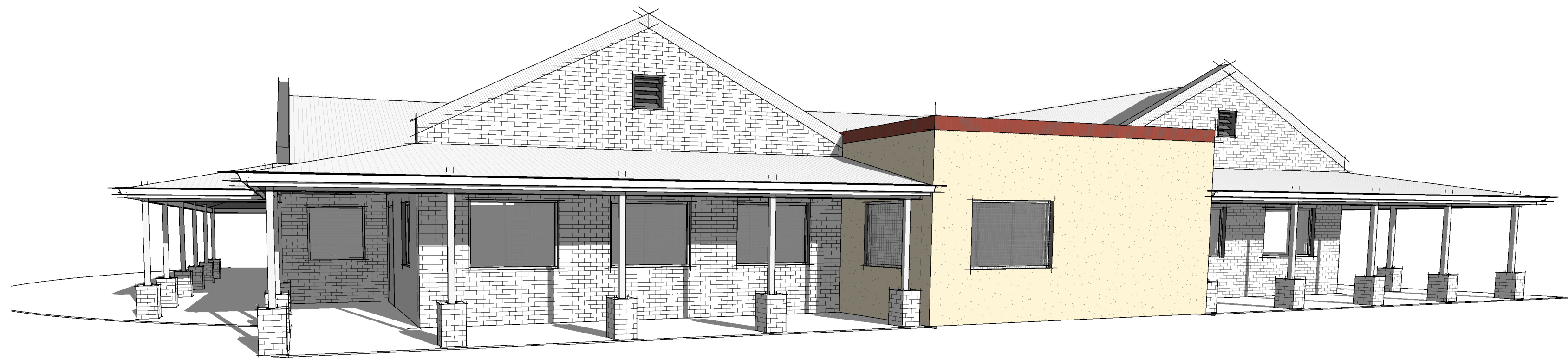
4 3D VIEW 3