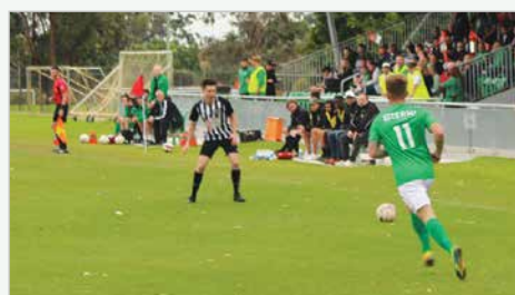
Kingsway Regional Sporting Complex.