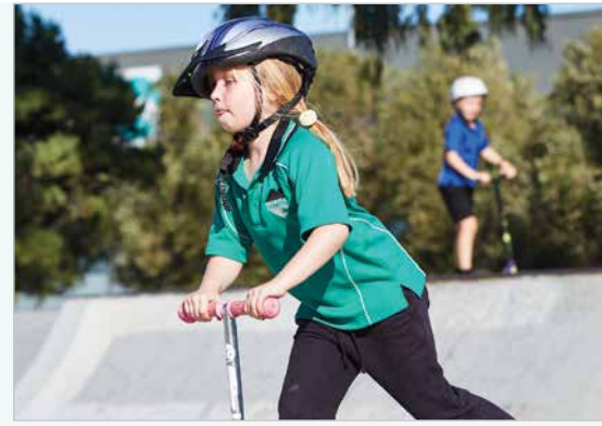
Clarkson Youth Centre skate park.