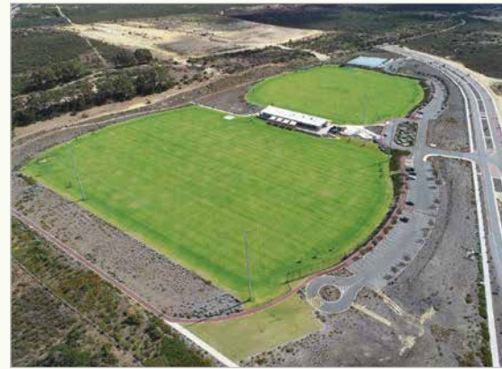
Splendid Park, Yanchep.

The City plans to use up to $2.2 million provided by the Australian Government, through the Local Roads and Community Infrastructure Program and the Building Better Regions Fund, and $400,000 from the State Government through the Department of Local Government, Sport and Cultural Industries to help deliver the facility.