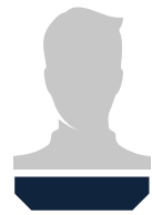
Mayor Currently vacant

23 Dundobar Road, Wanneroo, WA 6065 Monday to Friday 8.30am-5pm Locked Bag 1, Wanneroo WA 6946 T 9405 5000 After hours 1300 13 83 93 E enquiries@wanneroo.wa.gov.au wanneroo.wa.gov.au