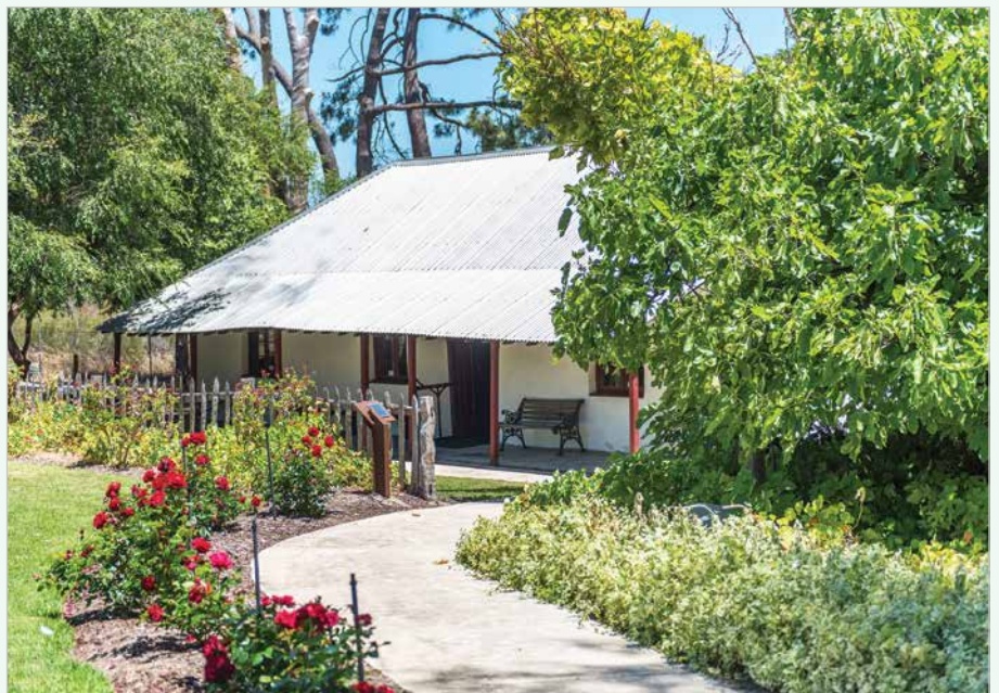
Completed in 1860, Cockman House in Woodvale was a family home for three generations.

Visit wanneroo.wa.gov.au to find out more.