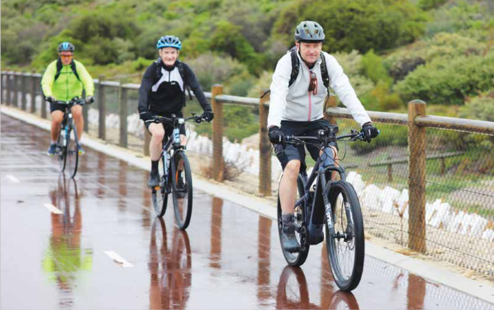
Cyclists enjoying the newly opened Burns Beach to Mindarie coastal path.