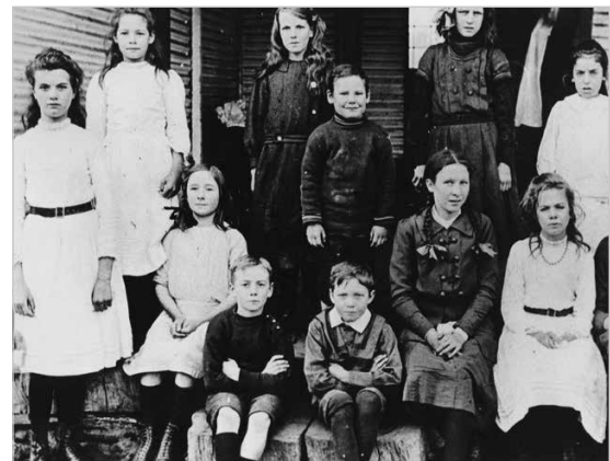
Wanneroo State School Class of 1911. PD02781.

For more information about these two stunning heritage properties visit wanneroo.wa.gov.au/cockmanhouse or wanneroo.wa.gov.au/buckinghamhouse