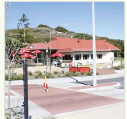
Orion Café, Yanchep.

Detailed design and community engagement has been completed. Construction is set to start in April 2023 and be completed by December 2024.