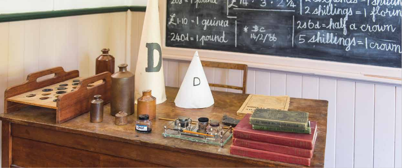
The Old Wanneroo School House is located beside Buckingham House on Neville Drive, Wanneroo.