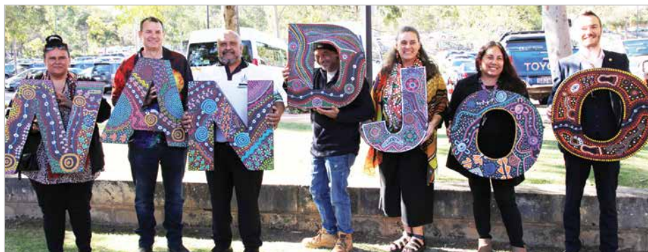
The City's Aboriginal and Torres Strait Islander Community Reference Group, Ni Kadadjiny Koort.