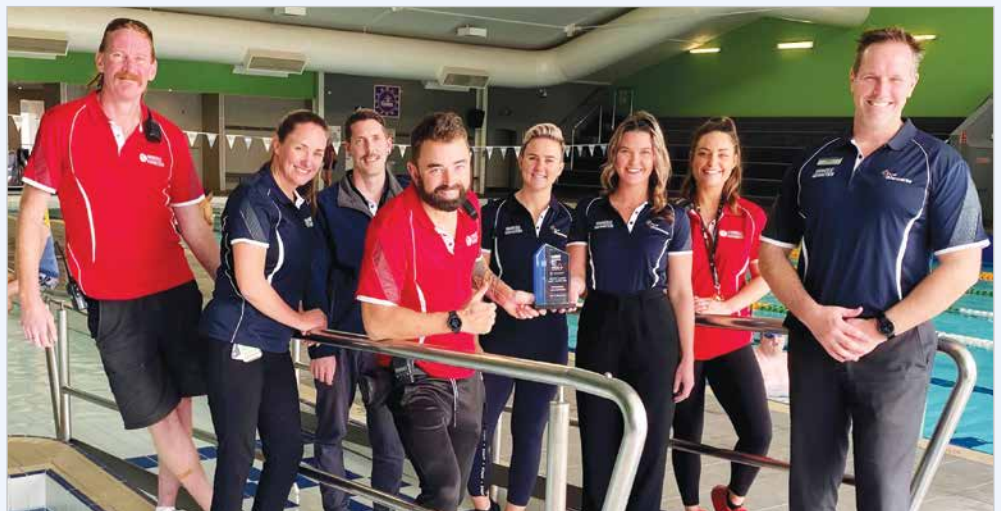
The award winning Wanneroo Aquamotion team.

"The team's commitment to compliance and safety is applaudable," he said.