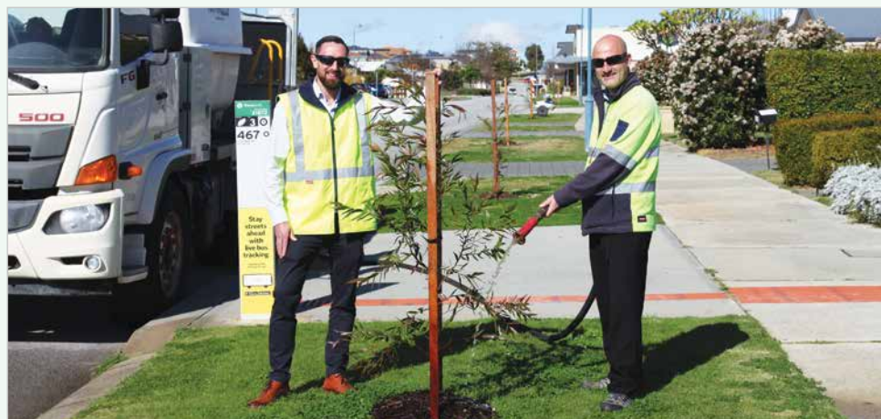
City Parks and Conservation Maintenance team members water a recently planted tree.

For more information, visit wanneroo.wa.gov.au