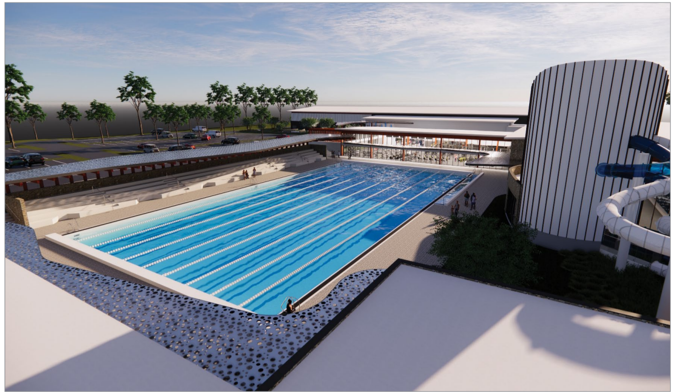
Alkimos Aquatic and Recreation Centre concept designs.