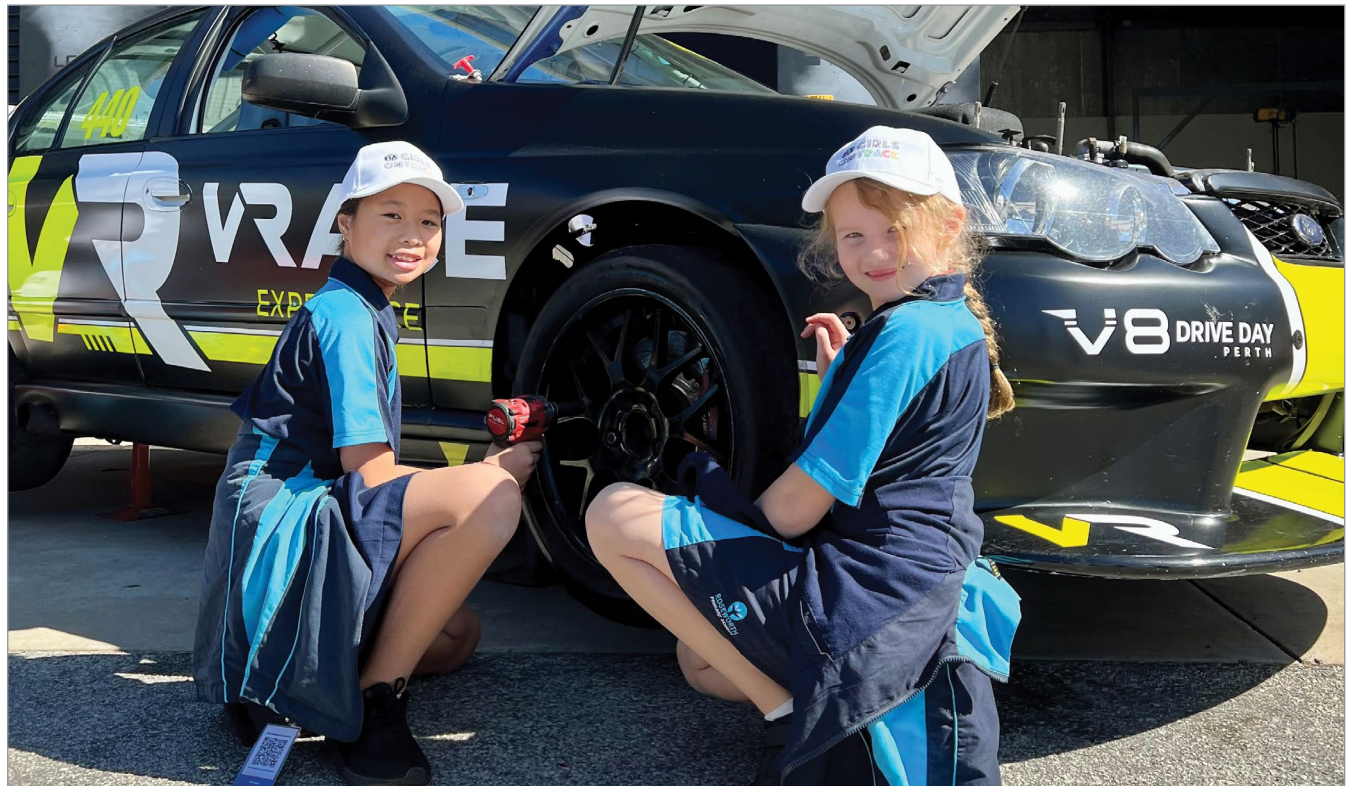
Girrawheen's Roseworth Primary School students on the tools at Wanneroo Raceway.