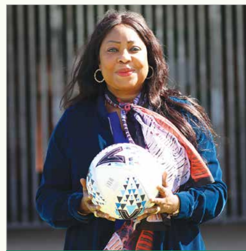
FIFA Secretary General Fatma Samba Diouf Samoura visited the facility in May.