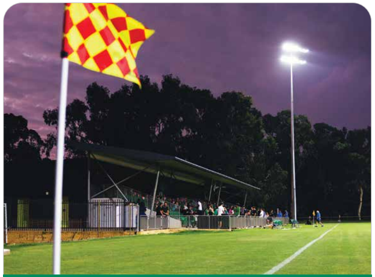
Kingsway's new lights in action.

Total cost $2.7 million - State and Federal Government funding, $126,000 City funding