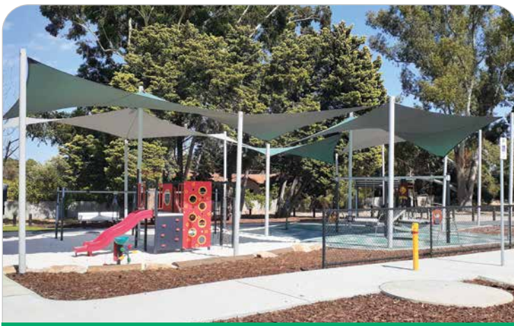
Fragola Park playground, Landsdale.