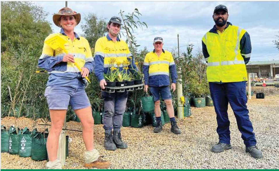
City Parks and Conservation Management staff with the trees and tube stock.

The City has also successfully used floating wetlands in the lake at Ridgewood Park.