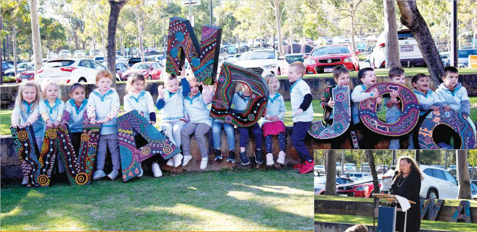
Goodstart Early Learning Centre students at the City's 2023 NAIDOC Week flag-raising ceremony.