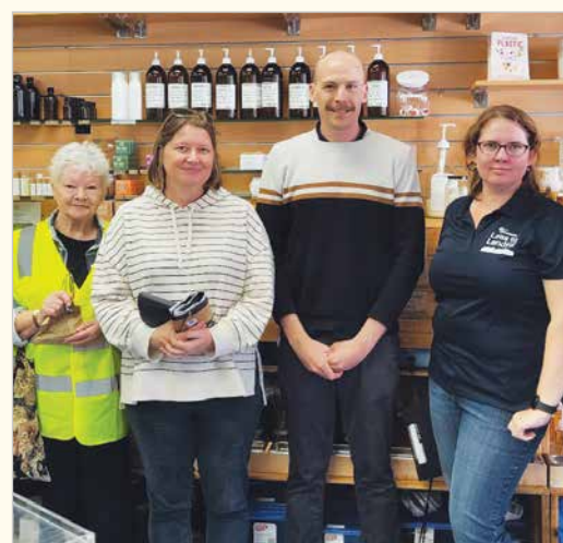
The Reduce in Wanneroo tour visited Weigh 'n Pay.