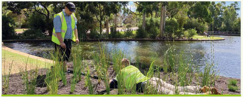
City Parks and Conservation Management staff install a floating wetland at Kingsway Regional Open Space.