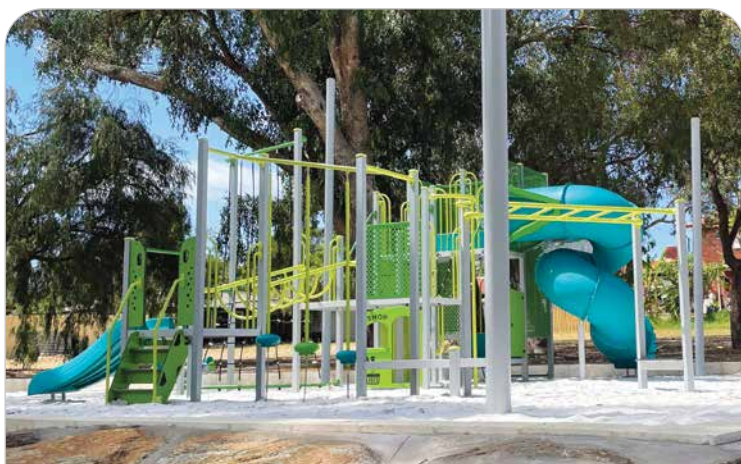
Taywood Park playground, Wanneroo.