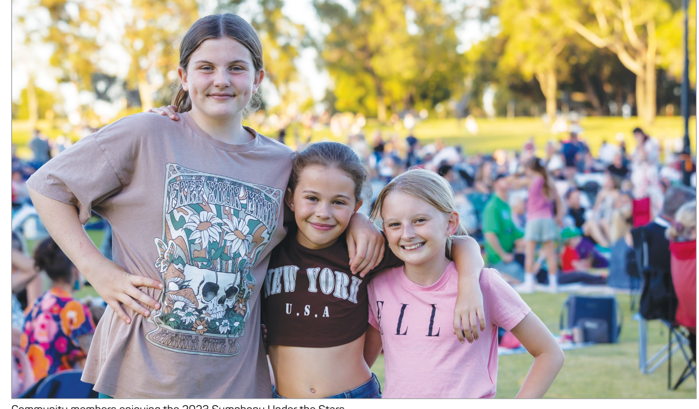
Community members enjoying the 2023 Symphony Under the Stars.