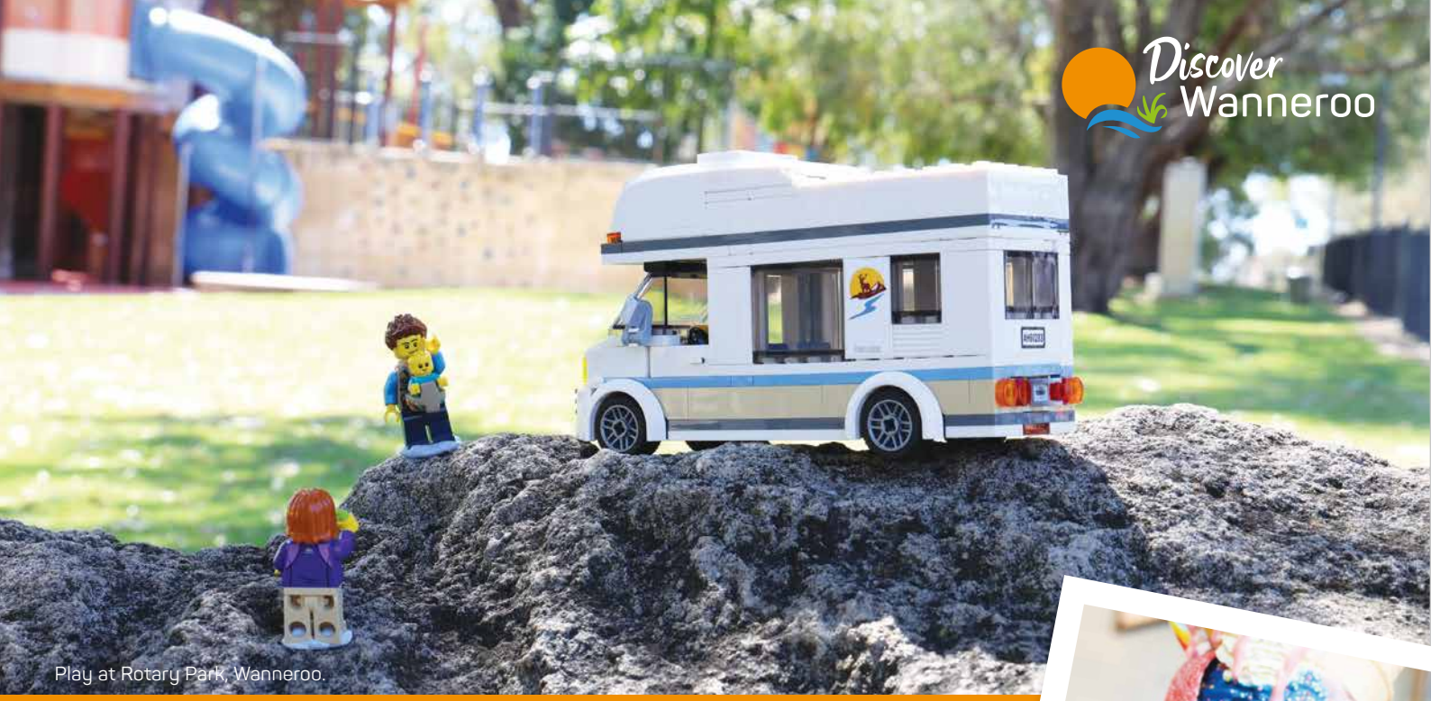
Play at Rotary Park, Wanneroo.