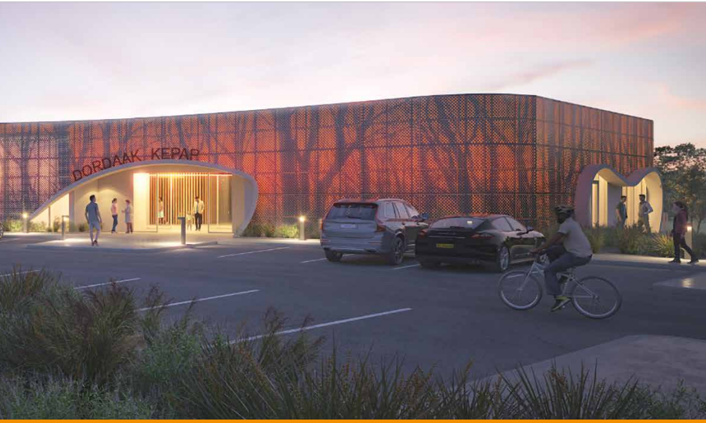
Dordaak Kepap Library and Youth Innovation Hub artist impression.

Detailed design on the Dordaak Kepap Library and Youth Innovation Hub is now complete, with the tender for construction underway.