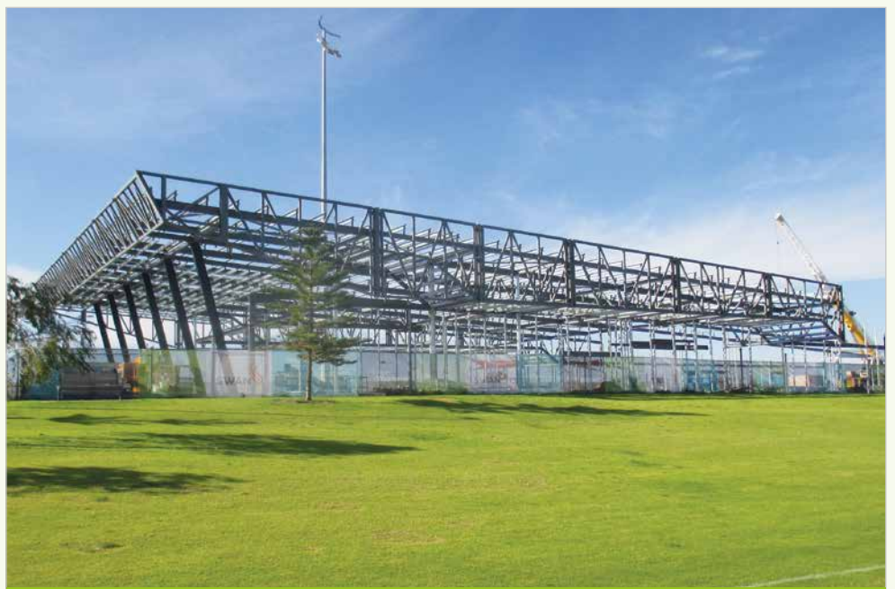
Work continues on the Halesworth Park pavilion.

Stage one of the Halesworth Park project included the construction of the 11.9 hectare sporting and recreation precinct, which boasts two multi-sport ovals, 16 multi-use