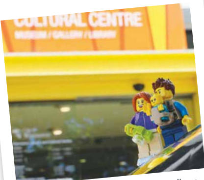
Cities at Wanneroo Regional Gallery