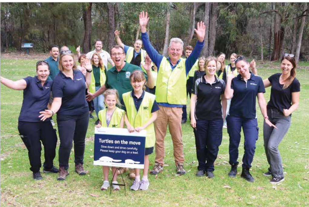
Turtle Tracker volunteers look out for turtles.

Some 80 dedicated local volunteers have trained to become Turtle Trackers, working hard to keep snake-necked turtles and their eggs safe this nesting season.