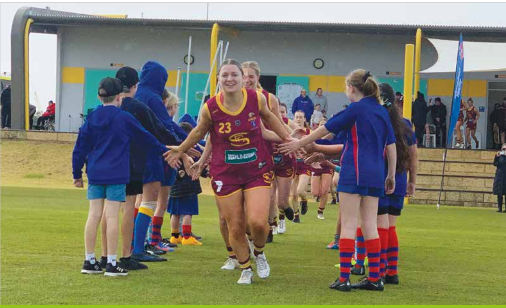
The Yanchep Red Hawks form a guard of honour at Splendid Park before the West Perth Falcons took on the Subiaco Lions in the WAFLW.