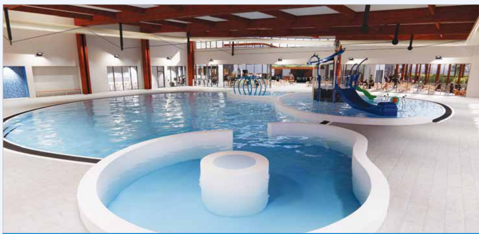
Alkimos aquatic and recreation centre concept image (concept only and final build may vary).

"It's great to have successfully secured a site that will ensure this facility integrates well with the surrounding environment and provides convenient access and connections to public transport," she said.