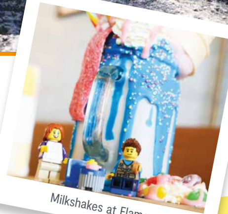
Milkshakes at Flames