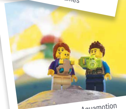
Splash at Wanneroo Aquamotion