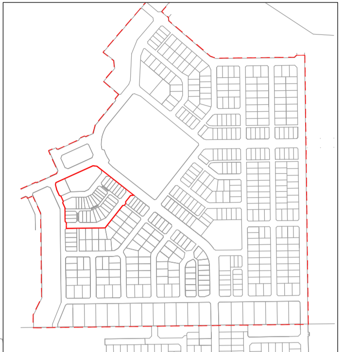
LOCALITY PLAN STAGE 1 APPROVAL WAPC 139130