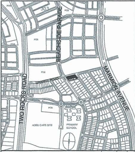
LOCATION PLAN 1: 15 000